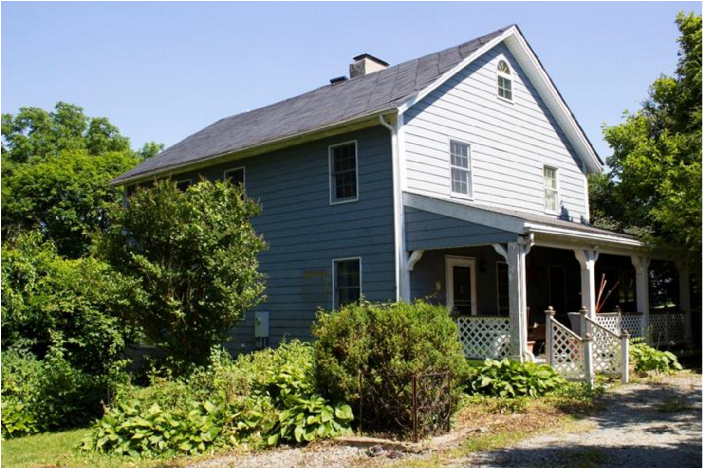
The 176-year-old Kurtz Mansion in Jarrettsville has been designated as a Harford County Historic Landmark.