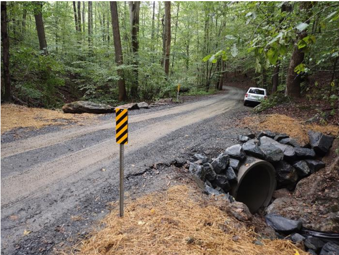
Culvert replaced under Guyton Road in Fallston