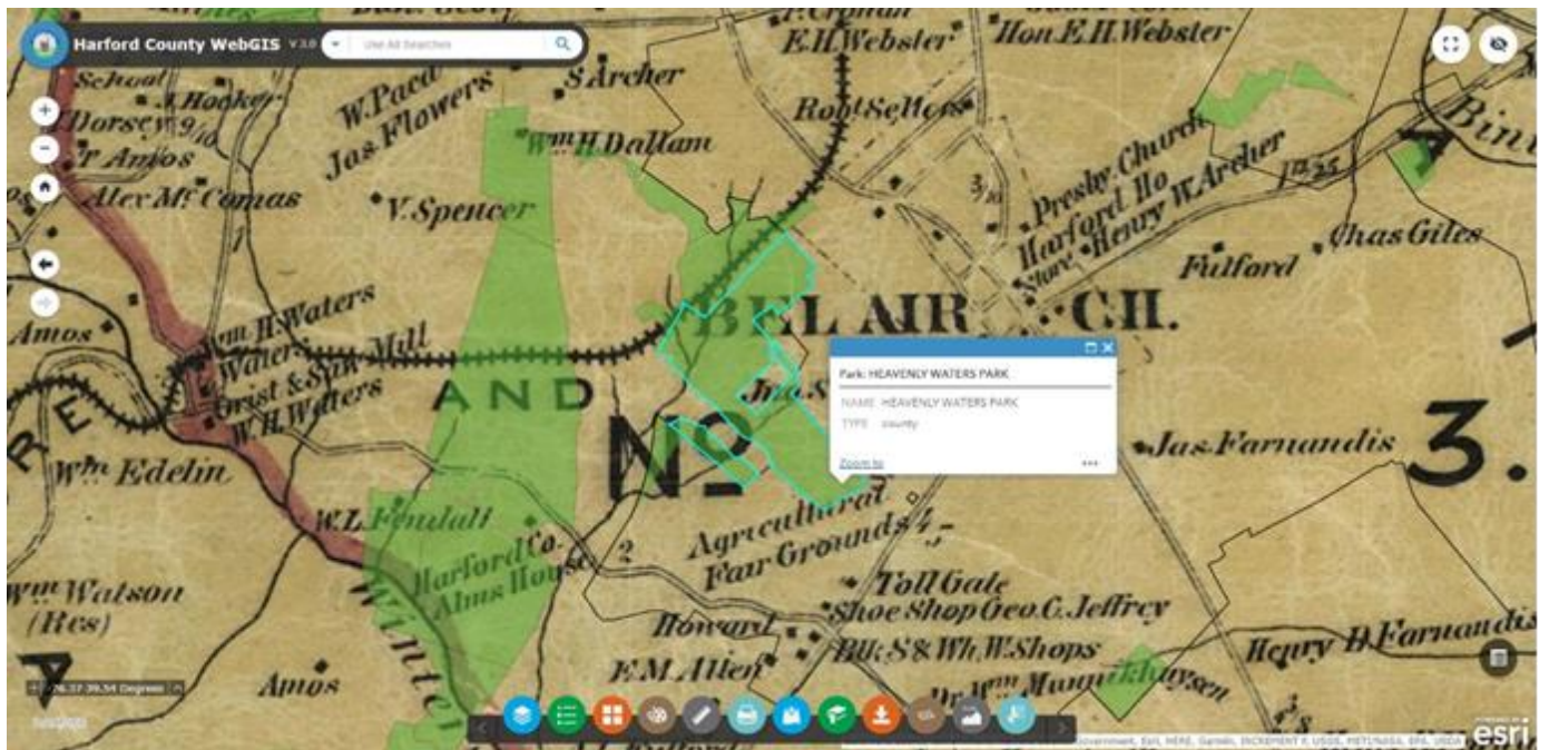
Starting with the base map from 1878, the county park layer in this image shows how the Ma & Pa rail line came through the future location of Heavenly Waters Park and Bel Air.