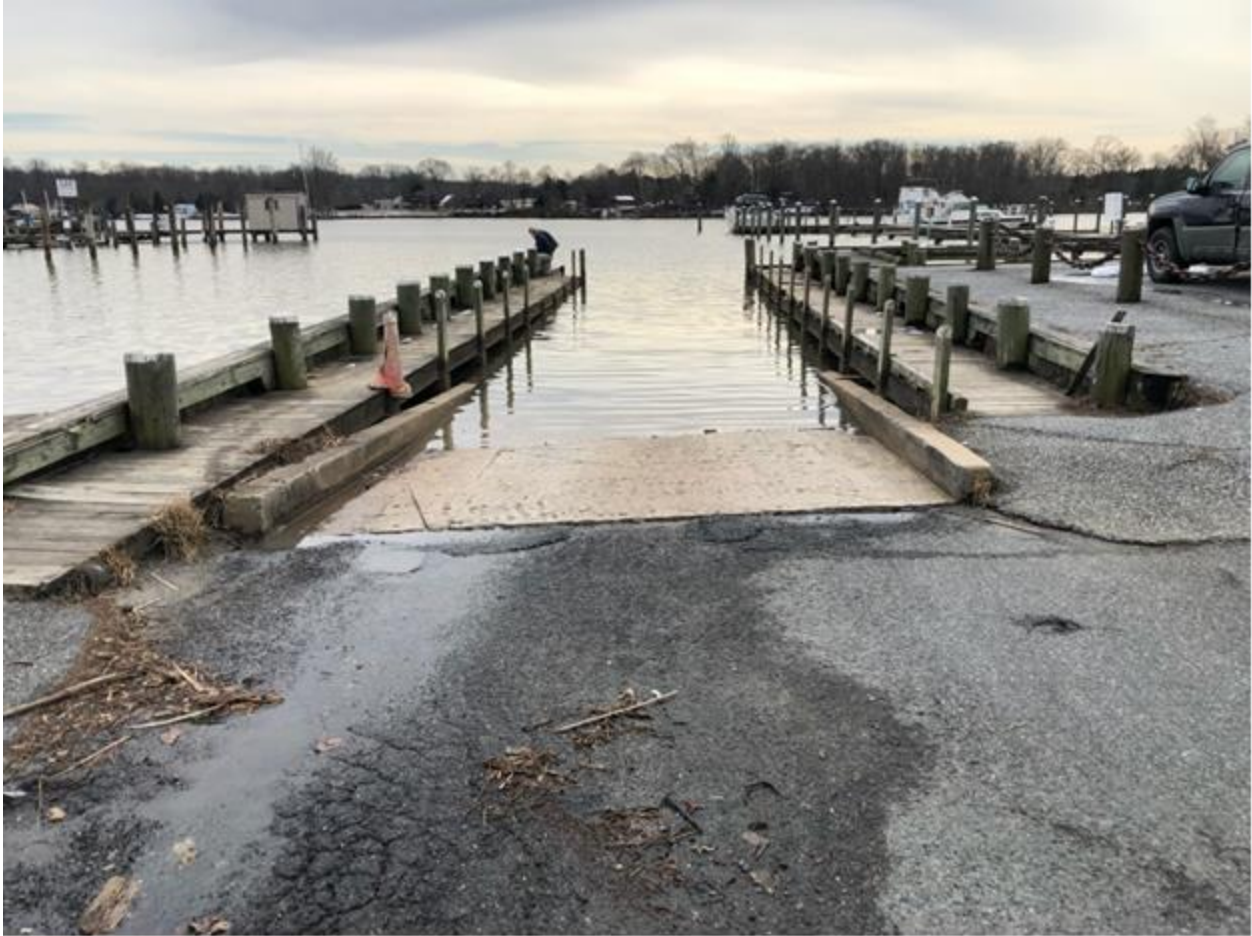
Otter Point Boat Launch in Abingdon