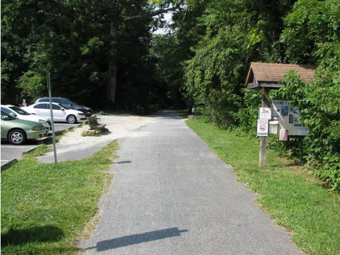
Williams Street trailhead with parking lot on the left