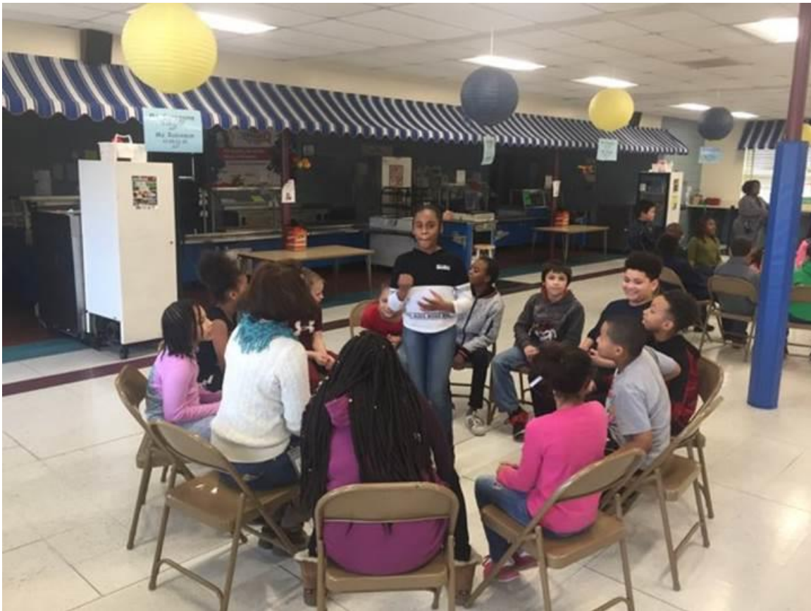
Photo caption: Fourth graders study conflict resolution at Hall’s Cross Roads Elementary School in Aberdeen.