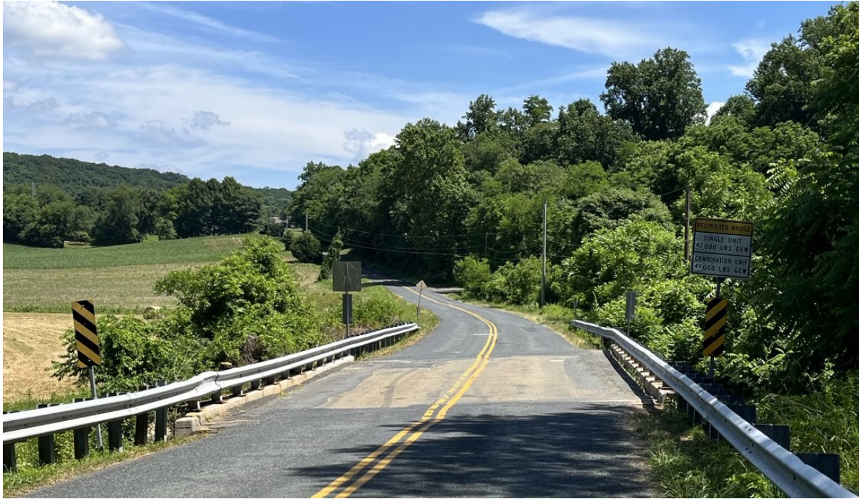
Photo caption: Heaps School Road in Pylesville was reopened Thursday, June 20, 2024, after repairs to the bridge over Broad Creek were completed.