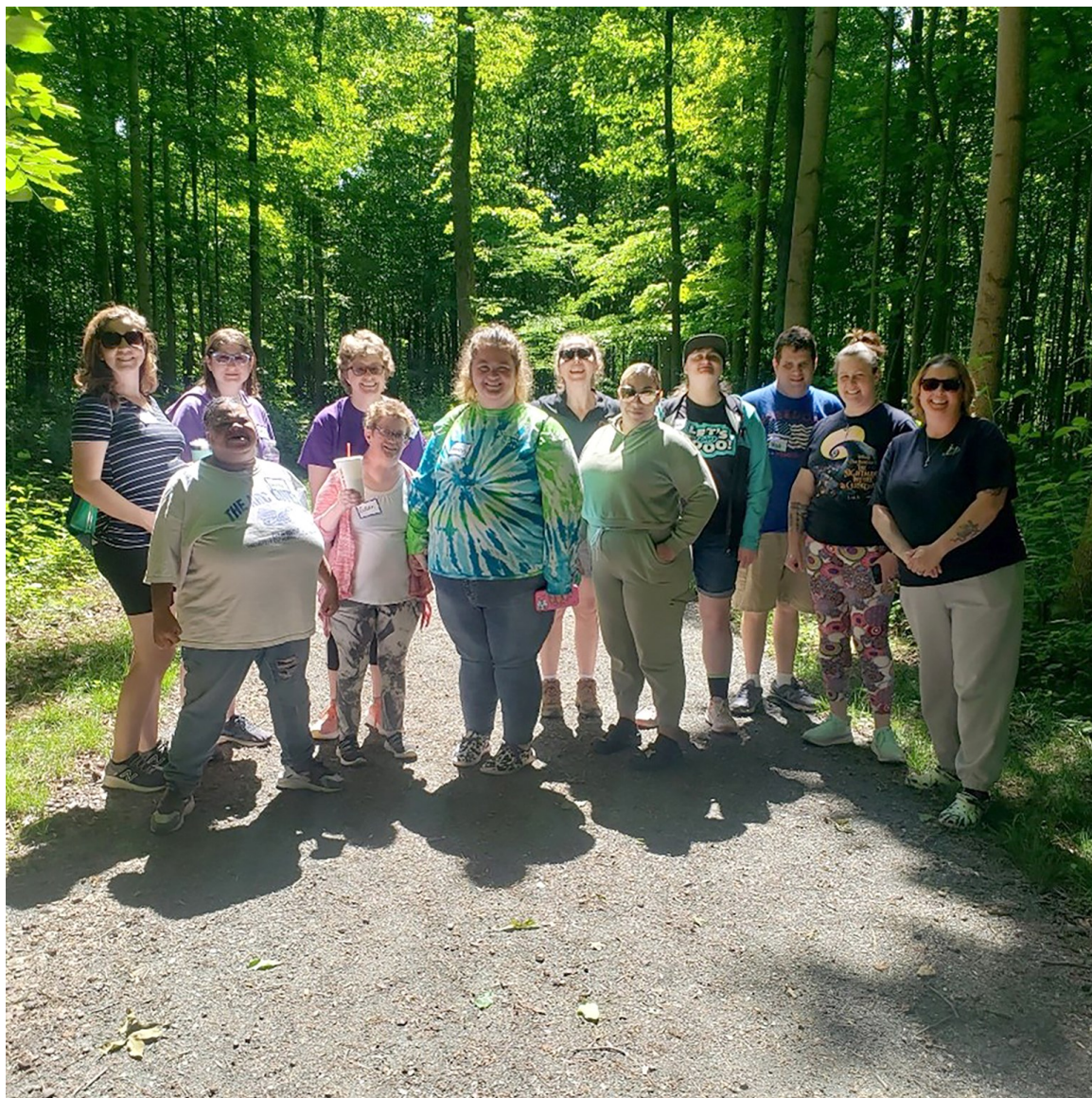
Photo caption: Participants from The Arc NCR pose with staff while on a nature walk at Chesapeake Therapeutic Riding on May 31 st , 2024.