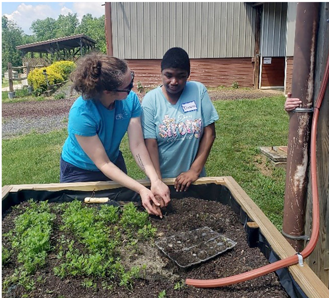
Photo caption: Participants from The Harford Center paint and plant carrot seeds at Chesapeake Therapeutic Riding on May 21 st and May 28 th , 2024.