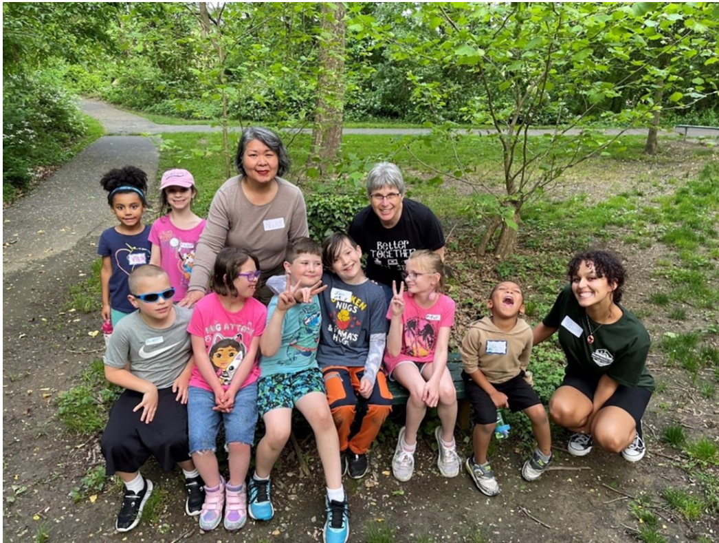
Photo caption: Staff and volunteers pose with Nature Social Group students after a hike at Mariner Point Park on May 16 th , 2024.

For more information about opportunities for citizens with differing abilities please visit Office of Disability Services | Harford County, MD (harfordcountymd.gov) and follow the Office of Disability Services on Facebook .