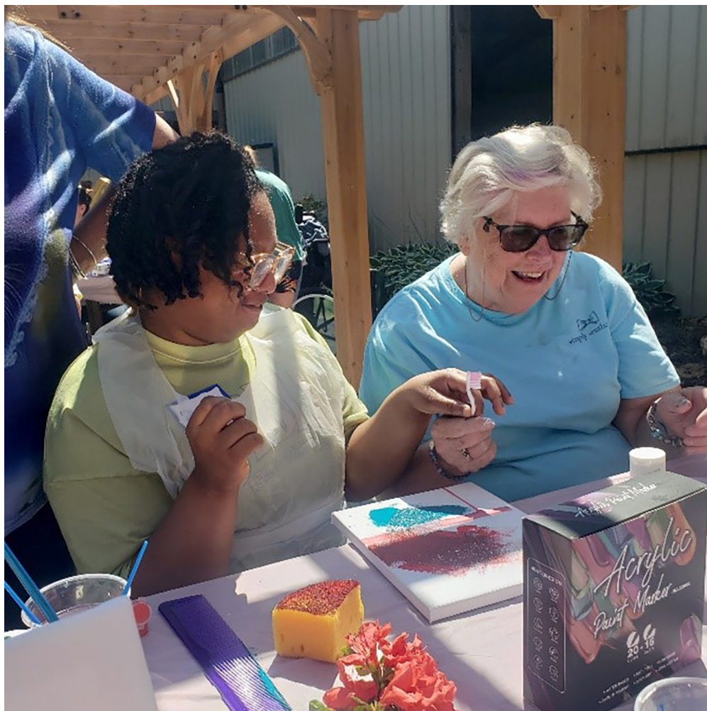
Photo caption: Participants from The Harford Center paint and plant carrot seeds at Chesapeake Therapeutic Riding on May 21 st and May 28 th , 2024.