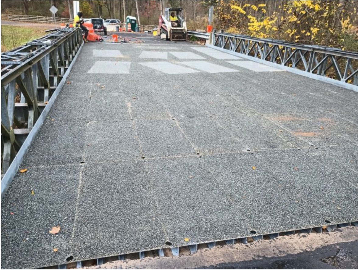
Photo Caption: The Houcks Mill Road bridge over Little Gunpowder Falls at the Harford/Baltimore County line in Monkton has been reopened after replacement of prefabricated deck panels.