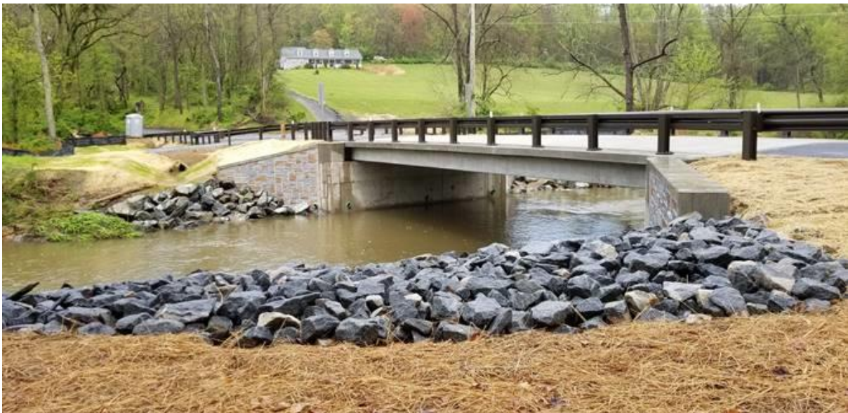
Robinson Mill Road Bridge opened to traffic April 30, 2020

Harford County Department of Public Works, Highways Division appreciates everyone's patience during this extended but necessary project for public safety.