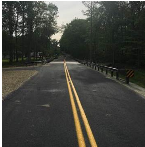
Glen Cove Road Bridge in Darlington

Questions about this closure may be directed to 410-638-3217 ext. 2437.